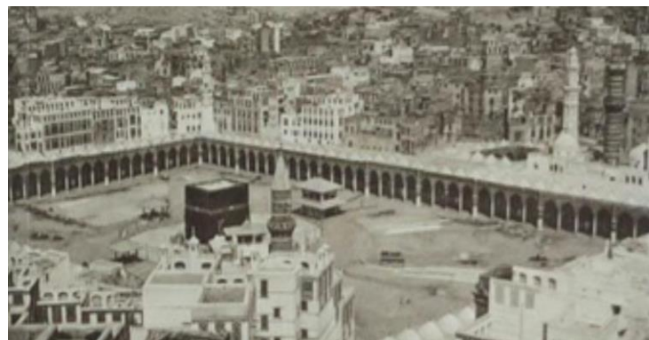
Leiden University Library, Or. 27.021

Research Phase 3 rd year of PhD programme